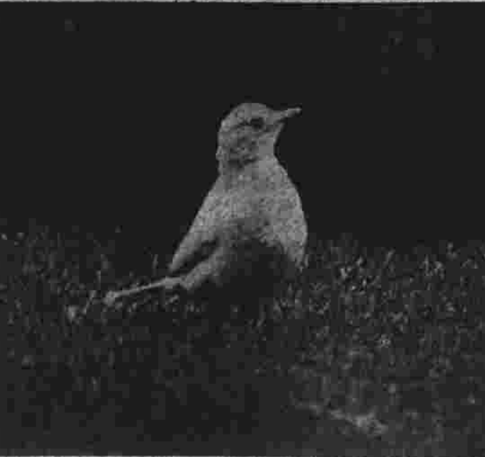
Herald of Early Winter?

Here's proof in another that residents in the Kenney-Morwell section of New Haven are seeing things when they reported spotting a white robin winging his way over backyards during the last few weeks.